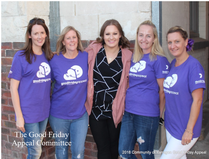
The Good Friday Appeal Committee

2018 Community of Yarragon Good Friday Appeal